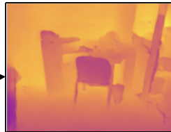
Metric Depth Map